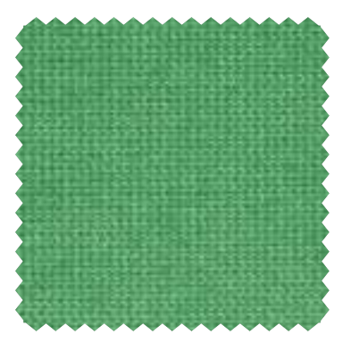
West Indies 635